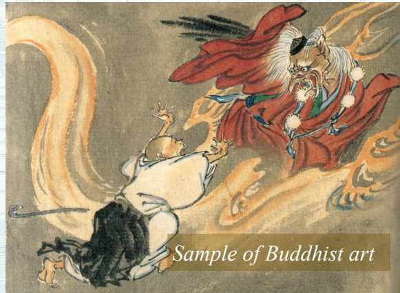
Sample of Buddhist art