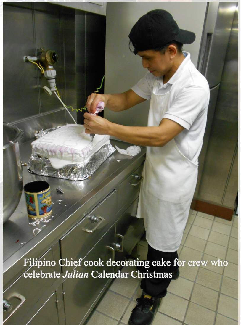
Filipino Chief cook decorating cake for crew who celebrate Julian Calendar Christmas