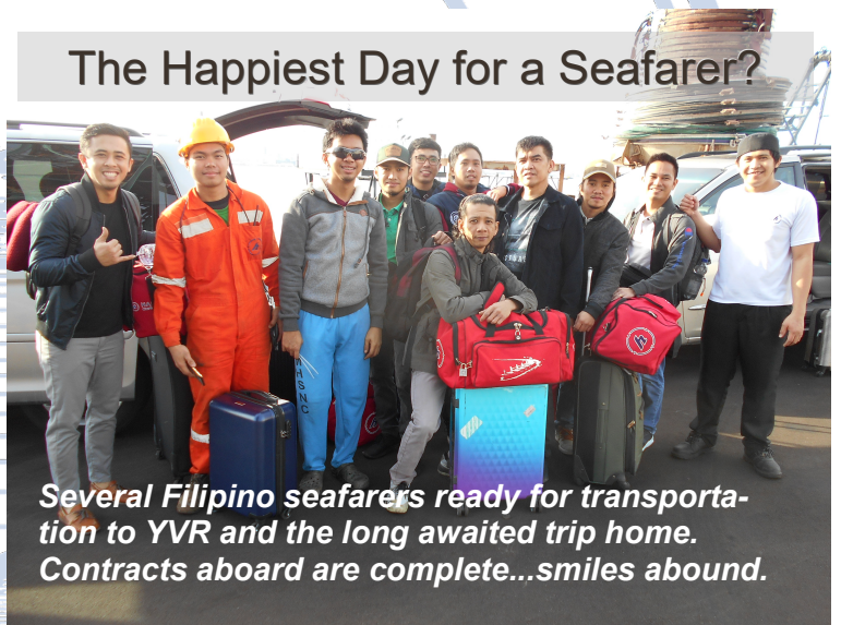
Several Filipino seafarers ready for transportation to YVR and the long awaited trip home. Contracts aboard are complete...smiles abound.

based solely on the grace of God revealed in Jesus Christ (Ephesians 2:8, 9) is very good news indeed.