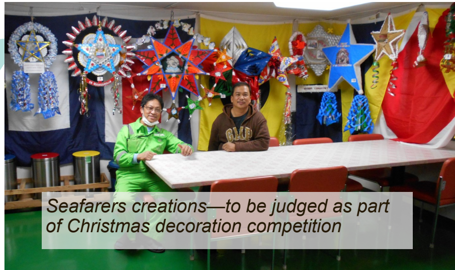
Seafarers creations—to be judged as part of Christmas decoration competition

“How can you believe if you accept praise from one another, yet make no effort to obtain the praise that comes from the only God?” (John 5:44)