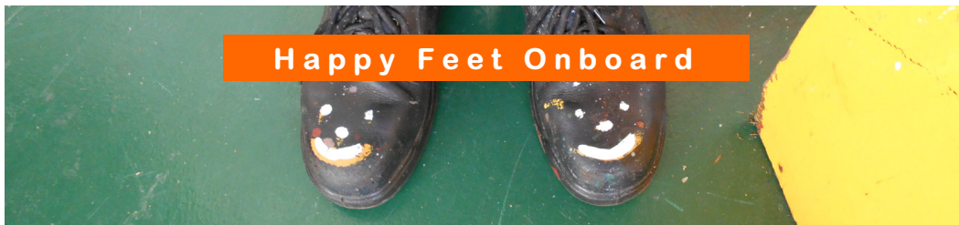
Happy Feet Onboard

Our day had been profoundly punctuated by a satisfying evening spent with these men at the LHM Surrey Fraser Centre. May God bless His Word.