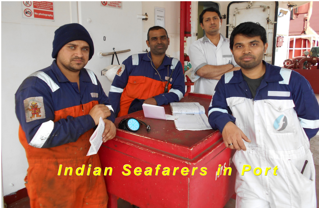
Indian Seafarers in Port